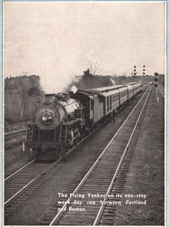
The Flying Yankee on its non-stop week-day run between Portland and Boston.