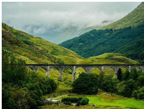
Glenfinnan Viaduct at Loch Shiel

One of the reasons that SLIC decided to host a Wikimedian in Residence was to help to increase the quality and quantity of content about Scotland on the Wikimedia projects, such as Wikipedia and Wikimedia Commons. With the help of our network of librarians around Scotland and the communities they work with, Wiki Loves Monuments can be a great tool for filling the gaps in Wikipedia when it comes to Scotland's rich heritage.