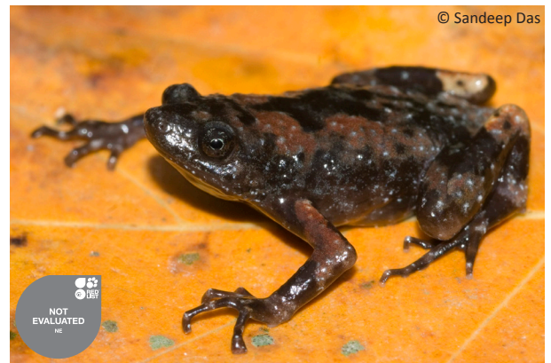
Image 6. Uperodon montanus