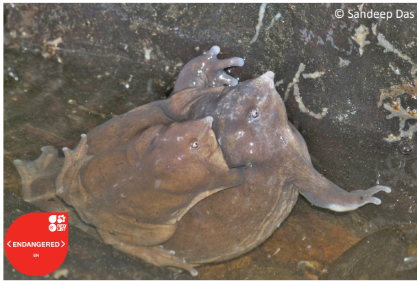
Image 7. Nasikabatrachus sahyadrensis