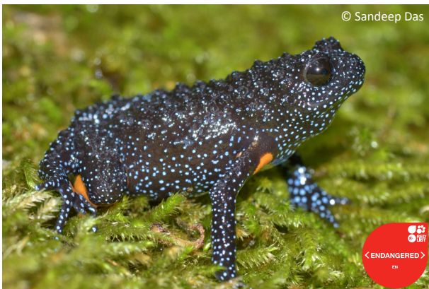
Image 5. Melanobatrachus indicus