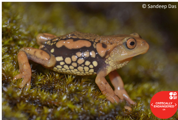
Image 13. Raorchestes resplendens