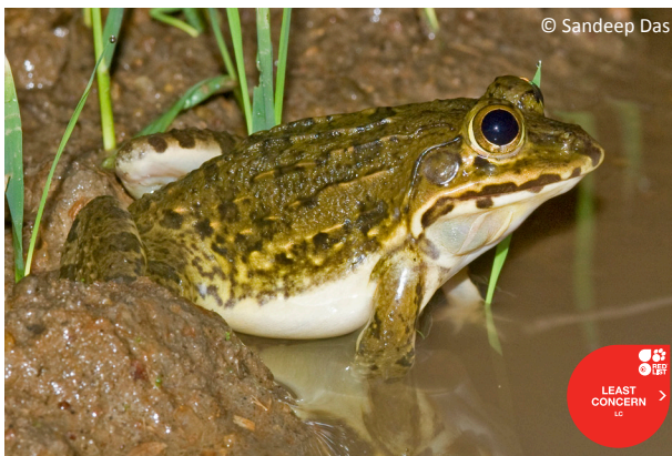
Image 3. Hoplobatrachus crassus