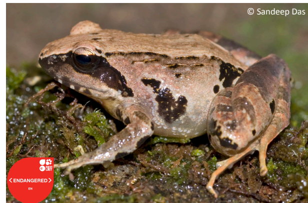
Image 10. Indirana diplosticta