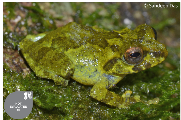
Image 12. Raorchestes crustai