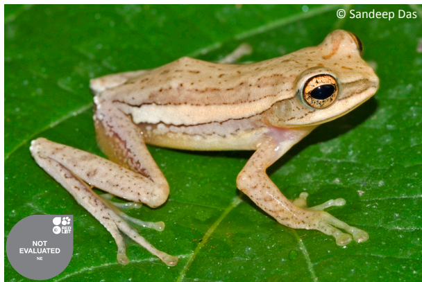
Image 11. Beddomixalus bijui