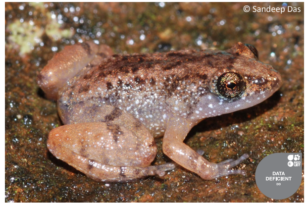
Image 8. Nyctibatrachus minimus