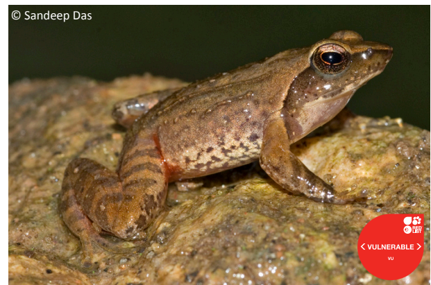
Image 4. Micrixalus phyllophilus