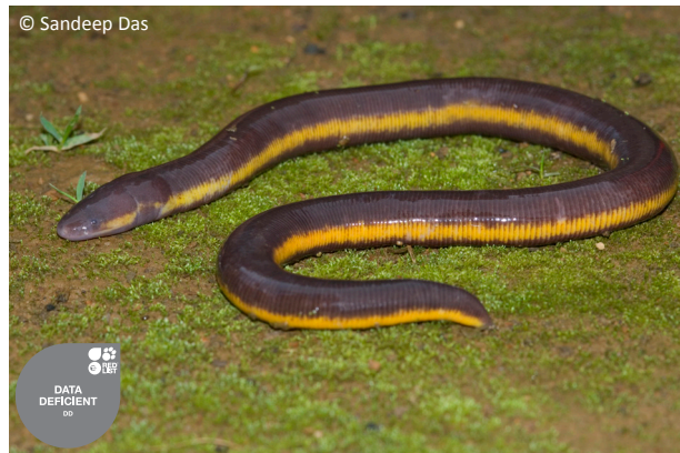
Image 14. Ichthyophis longicephalus