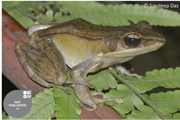
Image 9. Indosylvirana magna