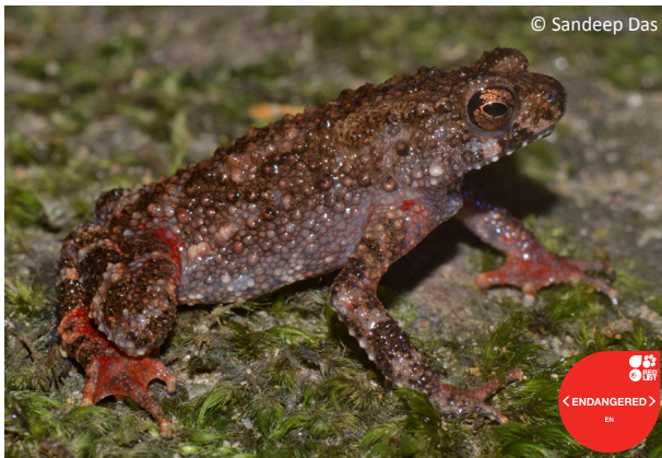
Image 1. Duttaphrynus beddomii