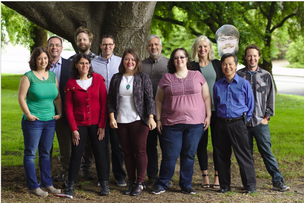
Wiki Education staff