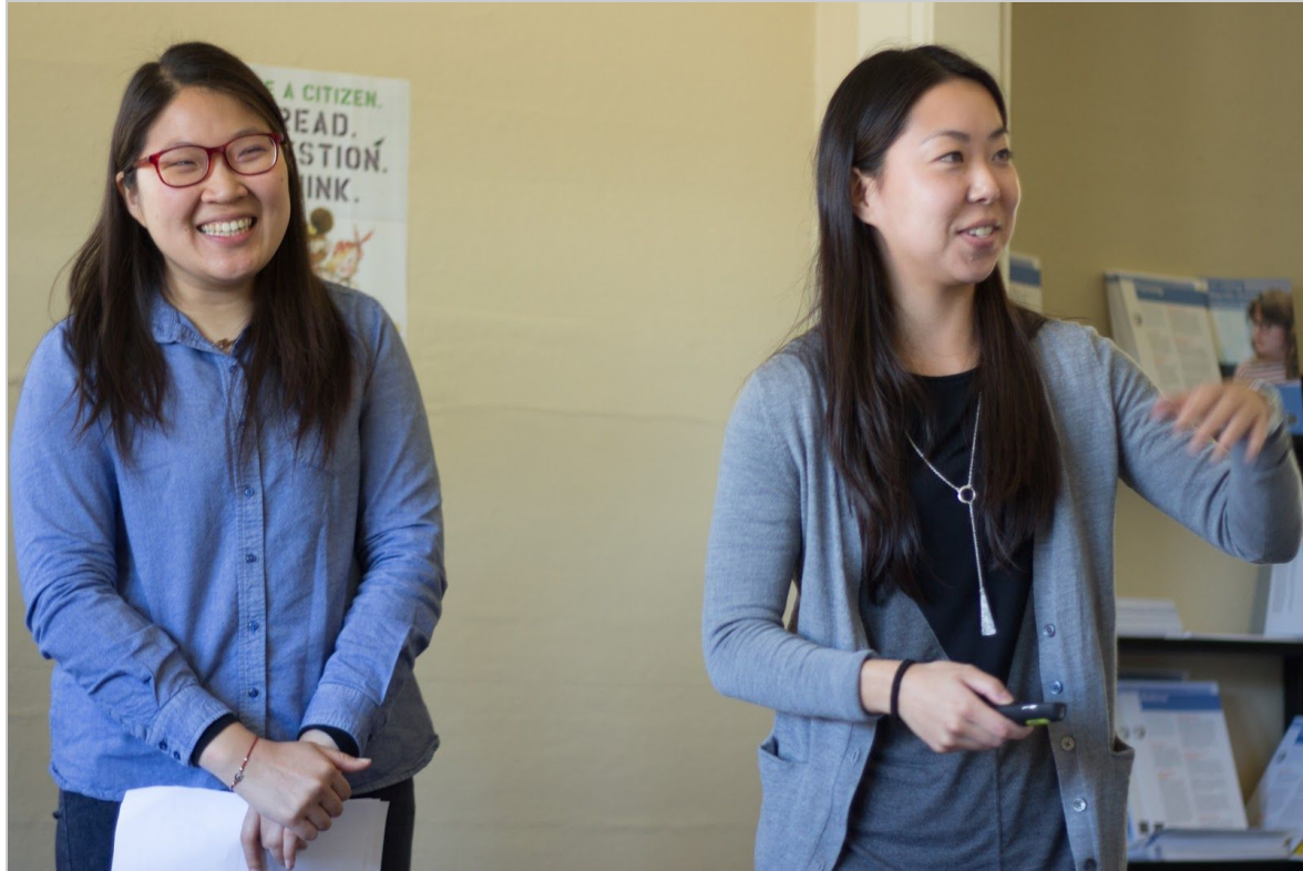
SFSU students presentation to Wiki Education staff.

With researchers at Carnegie Mellon University and University of Pittsburgh, we're preparing for a user experience research project that will test out some possible ways to foster a sense of community among the students participating in our projects. New and returning instructors will be able to opt-in to the study for the Fall 2017 term. During our all-staff meeting, we also hosted San Francisco State University students, who delivered presentations on the usability studies they have been conducting on the Wiki Education Dashboard.