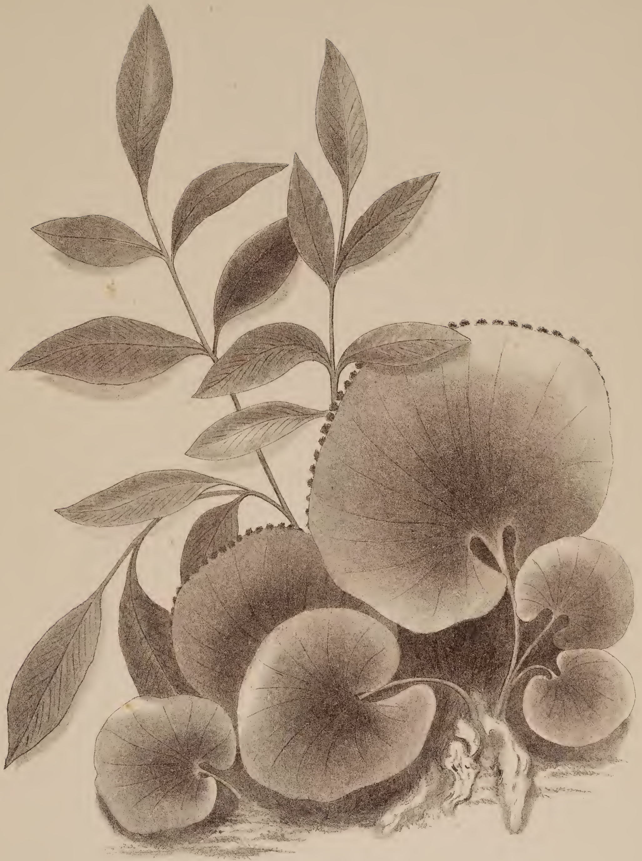
Trichomanes reniforme (Kidney fern.)

Abundant in forest of both Islands, growing on damp and rotten logs. Fronds nearly transparent when fresh. One of the most beautiful and singular ferns; confined to New Zealand.