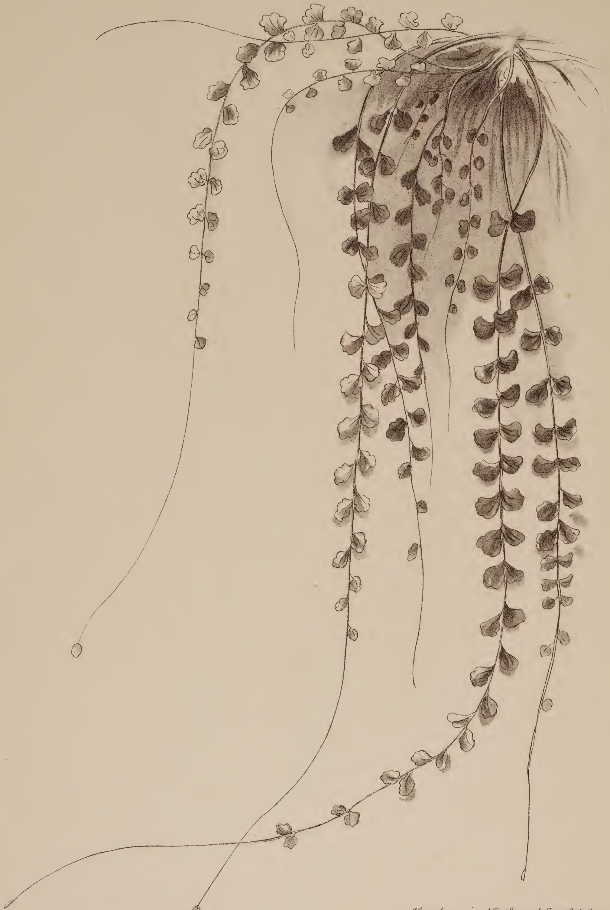
Asplenium flabellifolium (Whip-cord)

Abundant in North and South Islands growing on Rocks and stony places, also in Australia and Tasmania.