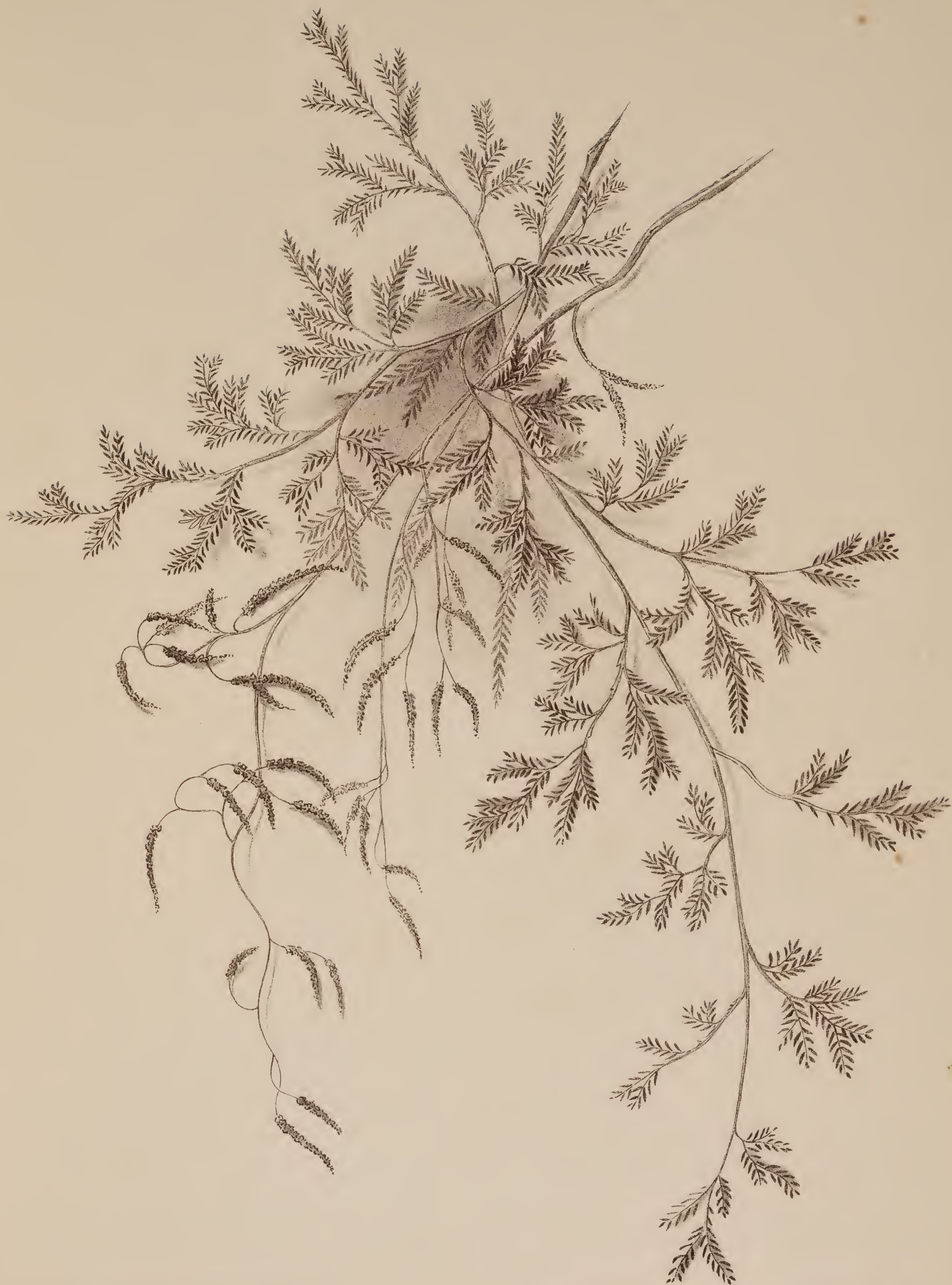
Lycopodium Billardieri, varium

This specimen is from the Dun Mountain Line, Nelson. It is frequently of a lovely golden colour.