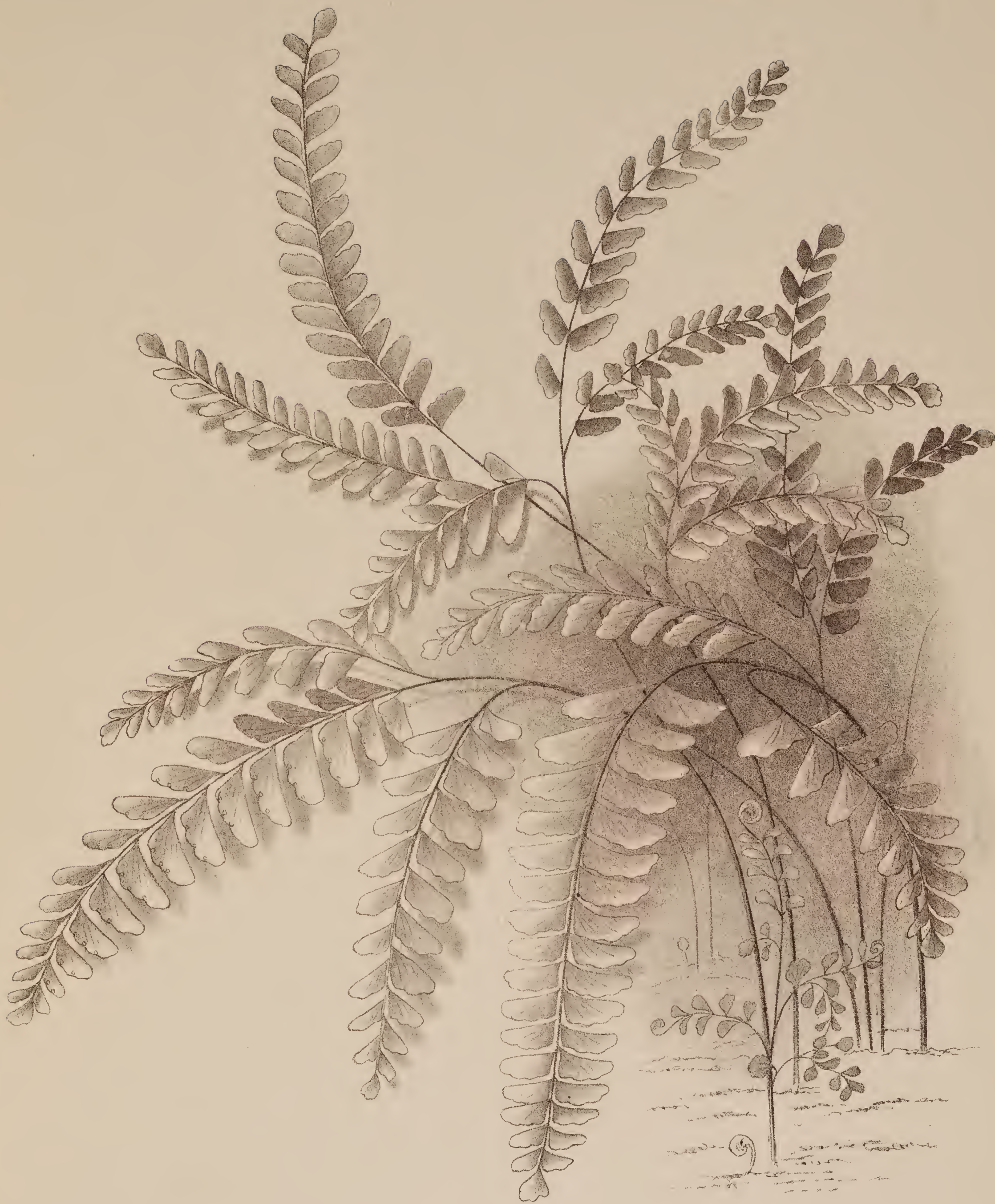
Adiantum Cunninghamii (Maiden Hair)

Growing in dense woods and damp places A large tropical and temperate genus.